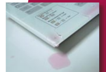
Waterproof tempered-glass keyboard