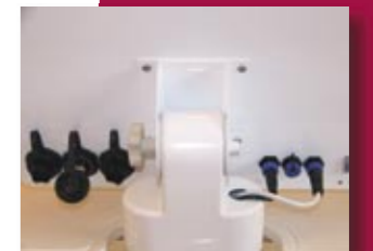
IP68 rear connections